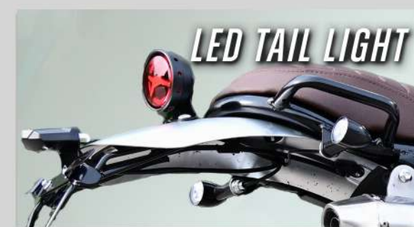
LED TAIL LIGHT