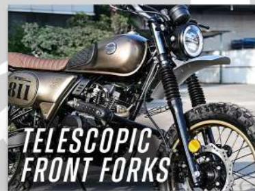
TELESCOPIC FRONT FORKS