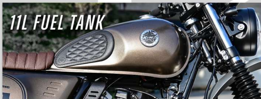
11L FUEL TANK