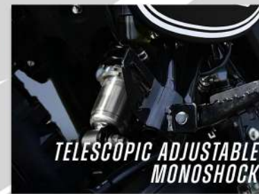
TELESCOPIC ADJUSTABLE MONOSHOCK