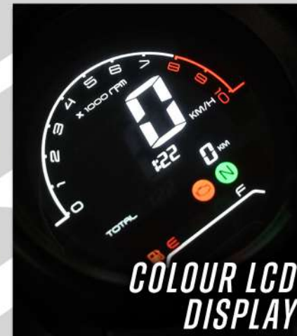
COLOUR LCD DISPLAY