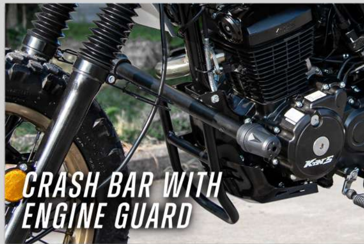
CRASH BAR WITH ENGINE GUARD