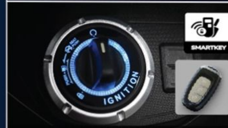
Intelligent Keyless System Smart Key Fob with Underseat Unlock Feature