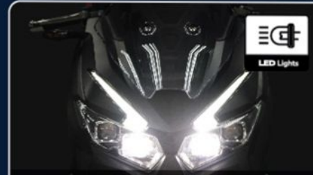
Adaptive Front Lighting System (AFS) 4 Bright Lenticels LED with AFS Features