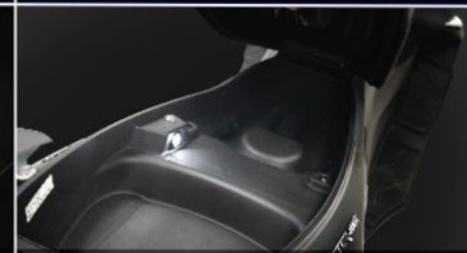
Large Under Seat Storage Capacity Space for 2 Helmets with Built-in Compartment Light