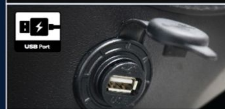
12V USB Port Convenience for Mobile Phone Charging