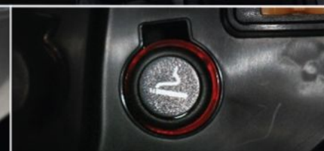
12V Lighter Power Socket Compatibility with Various Power Output Sockets