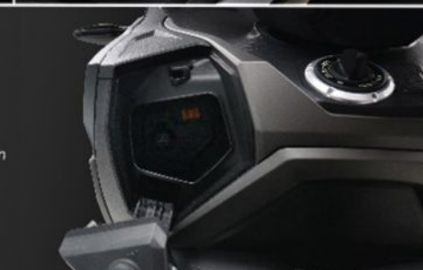
Large Side Storage Compartments Secure Left and Right Storage with Lockable Lids and Integrated 12V Power Socket