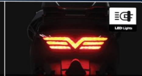
Emergency Stop Signal (ESS) V-Shaped Dynamic Tail Light with ESS Features